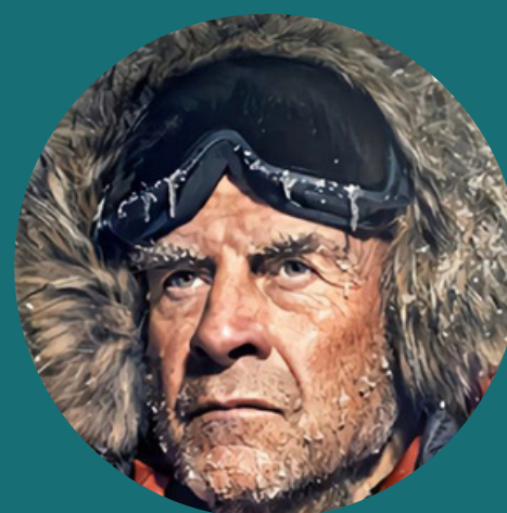
SIR RANULPH FIENNES