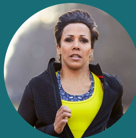
DAME KELLY HOLMES